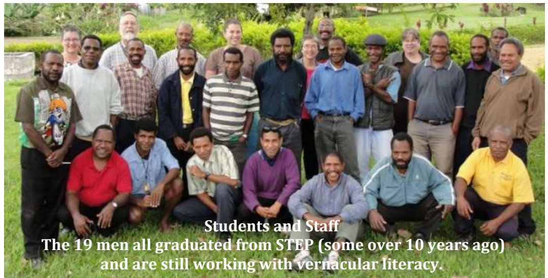
Students and Staff

The 19 men all graduated from STEP (some over 10 years ago) and are still working with vernacular literacy.