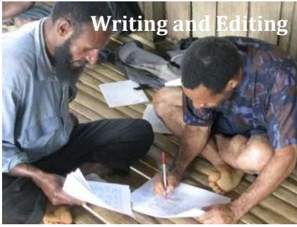
Writing and Editing