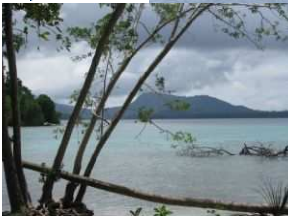
The ocean as seen from Mbaisan, the village on the other side of the island. ↑