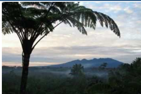
Sunrise in Walagu looking towards Mt. Bosavi, Southern Highlands Province

I am continuing to work on various projects for the Onobasulu program. STEP module 4 will begin the first of March and I will be teaching the ESL component in addition to my mentoring work with Betty.